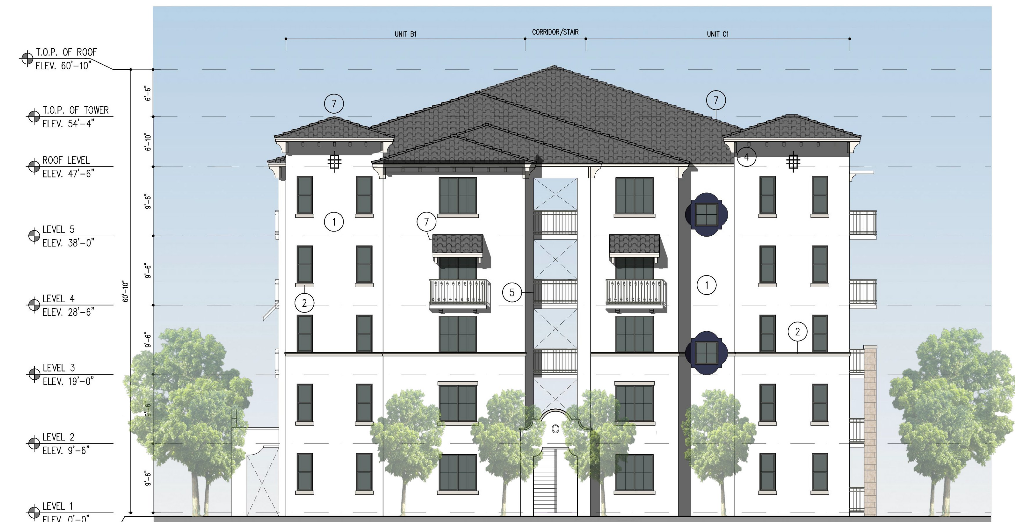
3 RIGHT ELEVATION